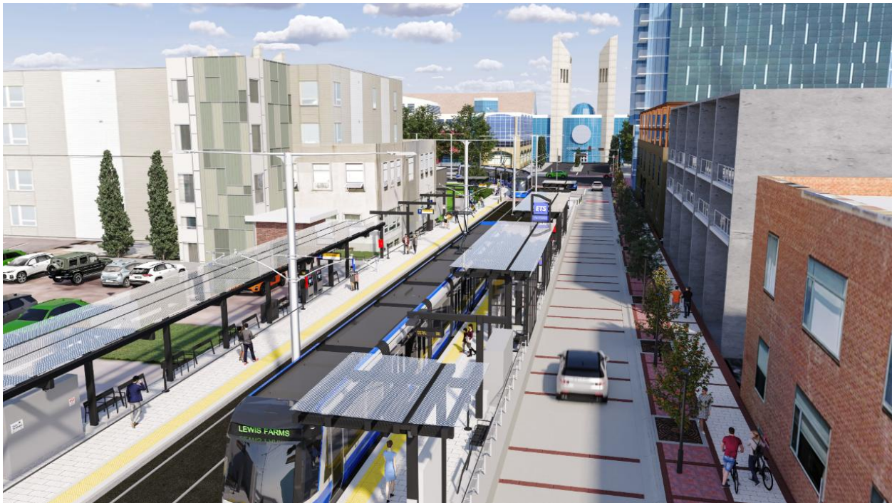
*Norquest Stop rendering

The information in this bulletin is current to May 15, 2026. Please note that all dates are approximate and weather dependent. We thank you for your patience during construction of the Valley Line West LRT project.